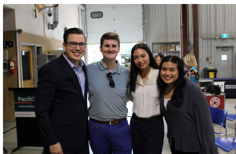
Attending the Honourable Harjit Sajjan's announcement of funding to help several Burnaby-based organizations commercialize new products, acquire advanced technologies and increase sales. Our support is integral as small and medium-sized businesses are the cornerstone of our economy.