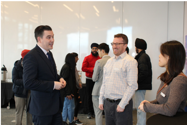
Meeting with the Capilano Students Union in constructive conversations to build better relationships with our community.