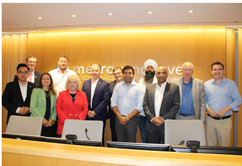
Discussing community growth through investments in infrastructure and housing with members of Liberal MP Colleagues and the Metro Vancouver Board.