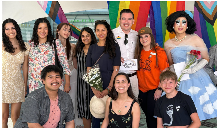
Engaging with the 2SLGBTQ+ in Parkgate to foster an inclusive space to support community action.