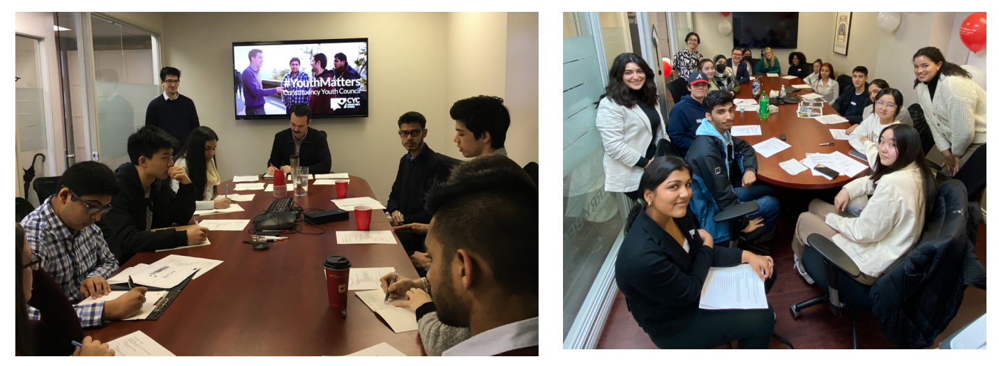
Our Constituency Youth Council is formed at the beginning of each academic year to bring the ideas of 15 to 25 year olds directly to us. We are always interested in having new members join, so reach out to our office if you want to contribute.