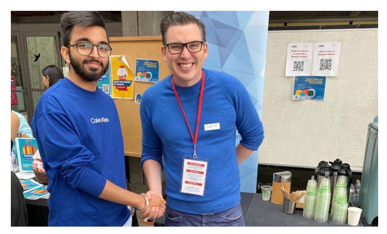
We work hard to stay connected to all the post-secondary institutions in our community. We are constantly engaging with student leaders and have created opportunities in our office for UBC, SFU, Capilano University, and BCIT students.

When we took office, Canada struggled to hire young people and give them the support they needed to get a good education. That is why we convened the Expert Panel on Student Employment. Their recommendations helped create more training opportunities for young Canadians while putting more money into their pockets when studying. Additionally, we have reached the highest rates of youth and student employment in Canadian history.