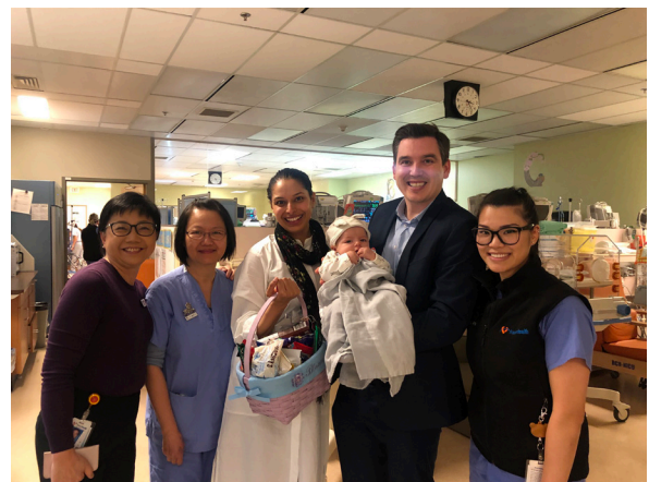
Thanking the nurses who helped deliver our daughter Nova.