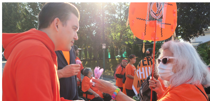
Receiving a medicine pouch from a member of the Tsleil-Waututh community on Truth and Reconciliation Day. An important part of reconciliation is respecting and understanding Indigenous communities' medical practices. We are committed to ensuring that Indigenous communities have good medical resources and professionals.