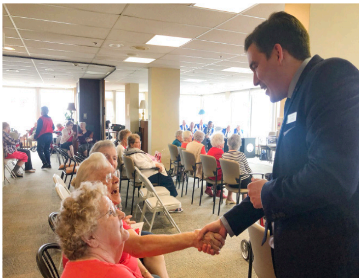
Connecting with seniors at Seton Villa's Canada Day celebrations!

We must educate ourselves to avoid tax scams, romance scams, binary trading schemes, and other large-scale asset transfer schemes. The dangers of telephone and internet fraud have been a concern of mine for years. I've had people close to me experience the stress and anguish of losing their life savings. I've also had many community members come and talk to me about life-altering experiences. This is often an issue people don't like talking about, but it seems almost everyone has a personal story about themselves or their friends and family regarding fraud. When we raised this subject at our Burnaby North-Seymour Interfaith Council Meeting, everyone had stories from their churches, mosques, gurdwaras, or social circles about someone who had been affected.