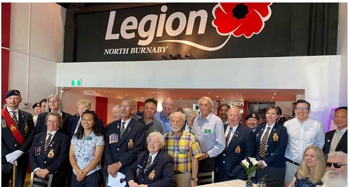
Celebrating the official reopening of the North Burnaby Legion 148.

60,000 other new affordable units being created under the National Housing Co-Investment Fund. Under the NHS, housing projects must meet minimum accessibility standards and must be barrier-free or have a full universal design. Another aspect of the NHS that will positively impact seniors is the Canada Housing Benefit. This benefit will provide rental support to 300,000 households across Canada, in large part to aid low-income seniors. We estimate that the Canada Housing Benefit will deliver an average of $2,500 per year to each recipient household. This will combat the real impact of high rents and will be positive for low-income and fixed-income seniors. Previously, we helped over 6,247 families get more affordable housing adapted to the needs of seniors through a $200 million investment in Budget 2016.