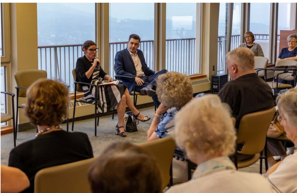
A roundtable conversation with seniors at Seton Villa in Burnaby in 2018. We invited the then Minister of Seniors, Filomena Tassi, to join us and hear from our community.