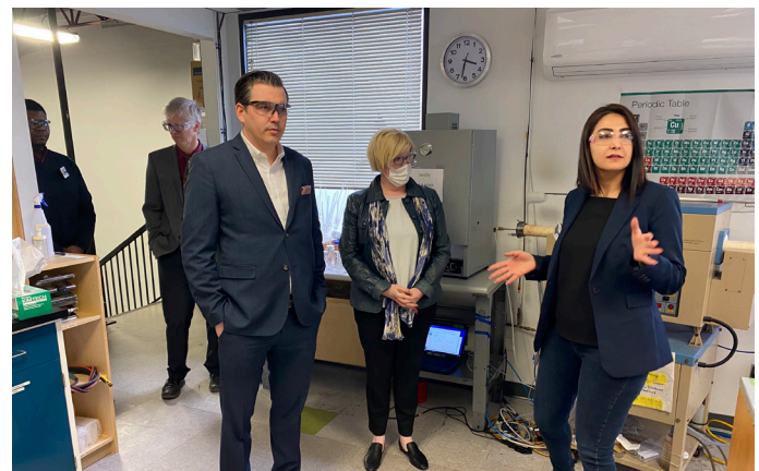
Touring NanoOne Technologies with Minister Carla Qualtrough.