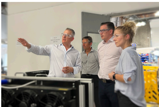
Meeting with the leadership of Loop Energy to learn more about how our Liberal Government's investments will create 119 jobs in our community.

Our Liberal Government is committed to ensuring that First Nations affected by natural disaster emergencies like the recent flooding in British Columbia are safe and secure. In partnership with First Nations communities, provincial and territorial governments, and non-government organizations, Indigenous Services Canada's Emergency Management Assistance Program (EMAP) helps communities on reserve access emergency assistance services. As part of this overarching plan, our Liberal Government has supported the First Nations Emergency Services Society of British Columbia with over $2,959,606 in funding. In response to the magnitude of the impact the flood has on our communities, the First Nations Emergency Services Society of British Columbia has additionally received $1,716,978 and 237,000 from the EMAP and Department of Crown-Indigenous Relations and Northern Affairs, respectively, to support the construction and maintenance of community infrastructure in North Vancouver, and $270,000 from the Department of Indigenous Services to supply emergency public services and administrative support.