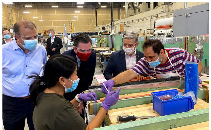
Visiting manufacturing facilities in our community with Minister of Innovation, Science and Industry François-Philippe Champagne. Our Liberal Government's investments protected jobs during the pandemic and have recovered more than 117 percent of the jobs lost to the