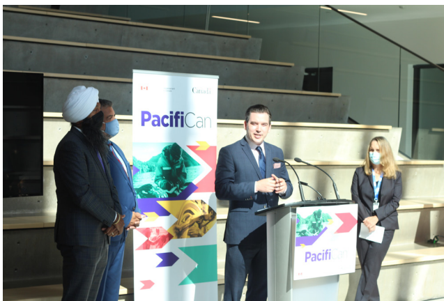
Announcing the creation of PacifiCan to create more economic opportunities in British Columbia.

As a Centre of Excellence for Commercialization and Research of the Networks for Centres of Excellence program, Simon Fraser University has received $1,807,000 from the Natural Sciences and Engineering Research Council, $1,787,400 from the Canadian Institutes of Health Research and $450,000 from the Social Sciences and Humanities Research Council. This will match funding from corporations, forming a private-public partnership to advance research.