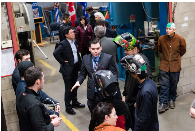
Speaking with welding apprentices at BCIT about how our Liberal Government has invested in making it easier to get certified in a Red Seal Trade.

Through the Department of Innovation, Science, and Economic Development, we are working to ensure Canadians of all backgrounds have equitable access to infrastructures and tools to support innovation and skill development across all disciplines. That is why we are investing $1,870,804 in research, innovation, and skill development programs at non-profits like Simon Fraser University, the British Columbia Technology for Learning Society, the Burnaby Neighbourhood House Society, and innovative local businesses like Nano One Materials Corps.