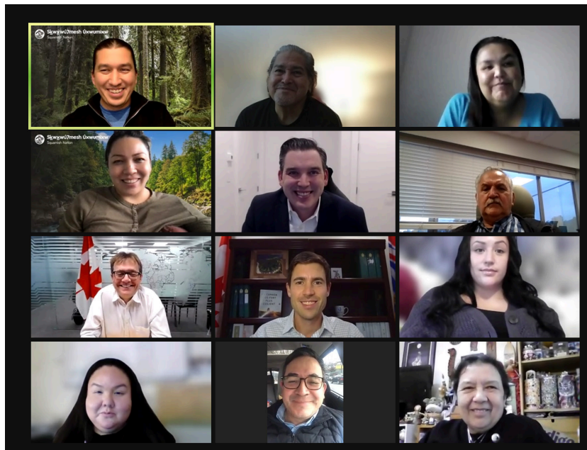
Meeting with Members of the Squamish Council alongside North Shore MPs Patrick Weiler and Jonathan Wilkinson.

In response to recent floods, the First Nations Emergency Services Society of British Columbia has received $1,716,978 and 237,000 from the EMAP and The Department of Crown-Indigenous Relations and Northern Affairs. These funds will support the construction and maintenance of community infrastructure in North Vancouver. An additional $270,000 from the Department of Indigenous Services will be used to supply public services and administrative support.