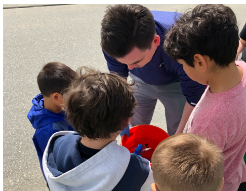
Participating in a garbage clean up with local students.