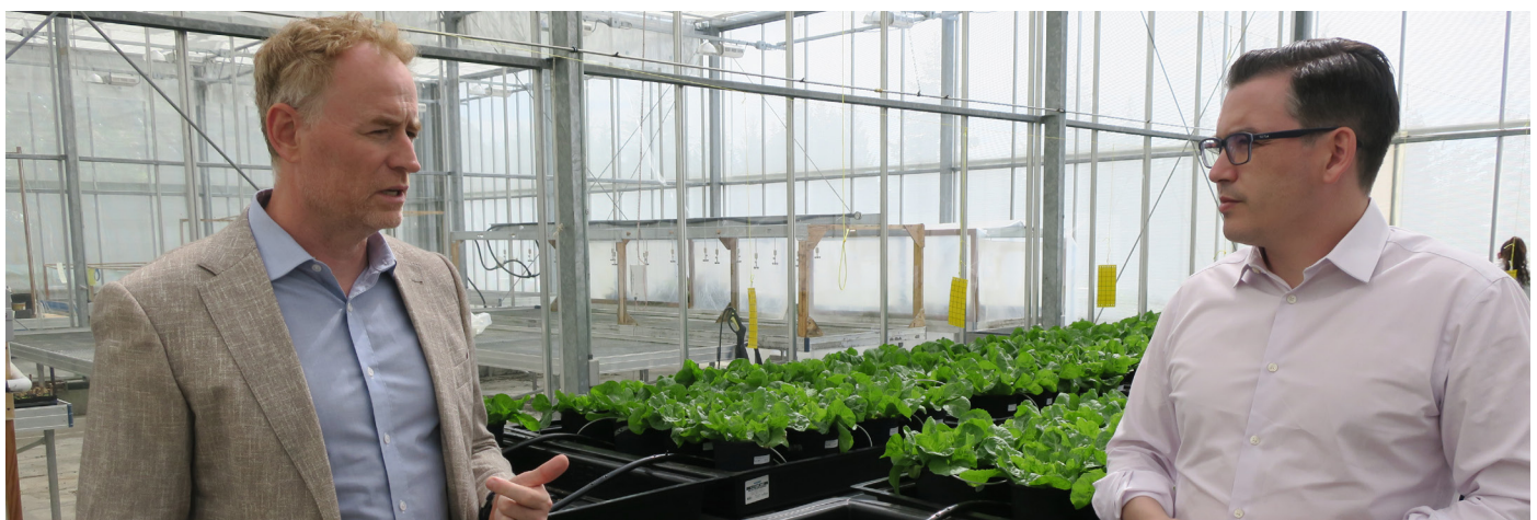
Touring Lucent Biosciences Greenhouse on the SFU campus to learn more about their incredible innovations that could help sustainable agricultural crops all around the world.

Our Liberal Government has made historic investments to support the forestry sector during the COVID-19 pandemic. To ensure that the forest sector remains strong, we are investing $368 million over three years for NRCan to update forest sector support.