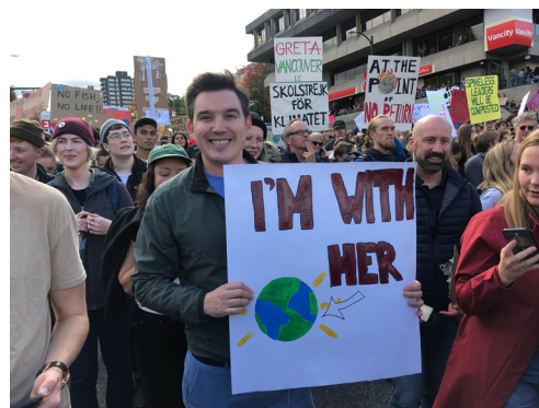
Taking part in a climate action protest with members of our community.