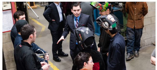
Speaking with welding apprentices at BCIT about how our Liberal Government has invested in making it easier to get certified in a Red Seal Trade.