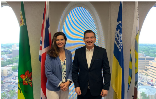
Meeting with Mayor of Regina Sandra Masters to discuss our shared priorities and our work to expand economic opportunities and affordability across Canada.