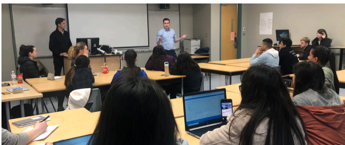
Chatting with local students about our work in parliament and how we are making education more affordable for all Canadians.