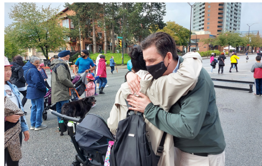
Connecting with community members at the first Hats Off Day since the start of the pandemic. We are helping to bring back major events with the Major Events and Concerts fund.