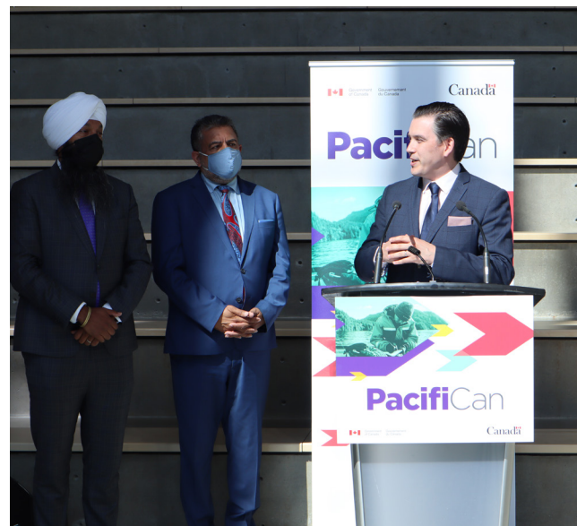
Announcing the creation of PacifiCAN alongside MP's Randeep Sarai and, Sukh Dhaliwal. Our office helped create this agency so that we could create more economic opportunities in British Columbia.