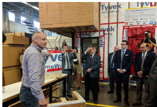
Learning more about the skilled trades programs on offer at the British Columbia Institute of Technology.