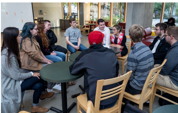
Hosting a roundtable conversation with students at SFU alongside Deputy Prime Minister Freeland.