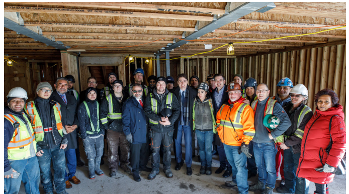
Visiting an affordable housing construction site with Prime Minister Trudeau and members of our caucus. Our Liberal Government is making the largest housing investment in Canadian history, to create thousands of new affordable homes and thousands of good paying jobs.