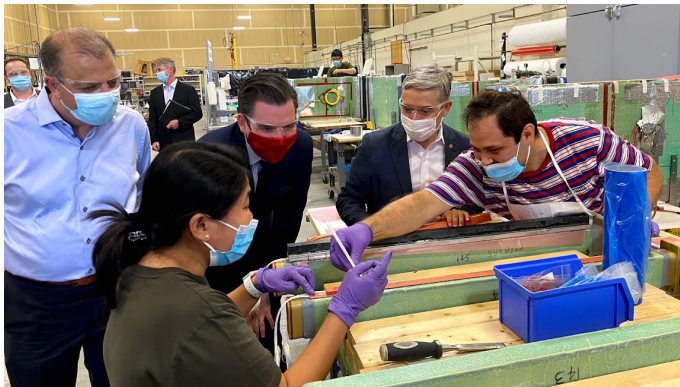
Visiting manufacturing facilities in our community with Minister of Innovation, Science and Industry François-Philippe Champagne. Our Liberal Government's investments protected jobs during the pandemic and have recovered more than 117 percent of the jobs lost to the pandemic.