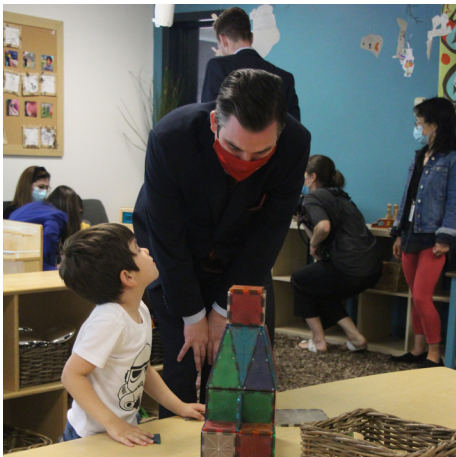
Visiting a local childcare centre with Deputy Prime Minister Chrystia Freeland. Due to our investments, children aged 6 months+ can now be vaccinated against COVID-19 and return to the classroom safely.

Slowing the rate of infection reduces the load on our hospitals, our doctors, and nurses to ensure they are not overwhelmed. Less overwhelmed hospitals mean far fewer preventable deaths, not just for people who have COVID-19. Quarantining measures for people who may have come in contact with the virus reduces the rate of infection and the number of people who may fall ill. Taken together, we can see that the graphed curve of new infections flattens. The actions each individual takes directly impact the progression and severity of this pandemic.