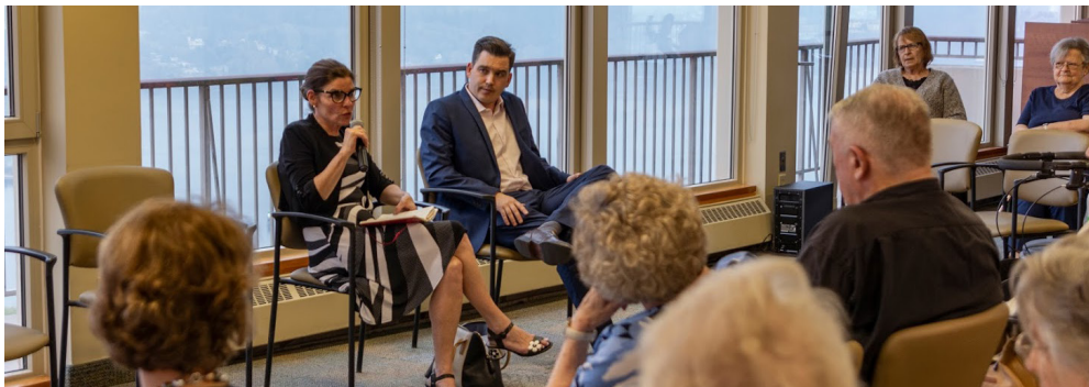
A roundtable conversation with seniors at Seton Villa in Burnaby in 2018. We invited then Minister of Seniors, Filomena Tassi, to join us and hear from our community.

There is no question that we need to protect those living and working in long-term care in Canada. We're working with the provinces and territories to help them deliver quality care to those in long-term care facilities, including by working towards national standards for the sector. We're also exploring Criminal Code amendments to penalize those who endanger and neglect seniors in care. The Prime Minister and Minister of Health have both held discussions with their counterparts in the provinces and territories on the importance of national standards, and that work is ongoing. Developing strong and coherent national standards takes time, but we are committed to doing the important work needed to get it right. To address current needs in the healthcare sector, we provided $740 million to provinces and territories through the Safe Restart Agreement to bring in infection prevention and control measures to protect vulnerable populations—including seniors living in long-term care and those receiving home or palliative care. More recently, in the 2021 Fall Economic Statement, we announced an additional $1 billion to create the Safe Long-Term Care Fund. This fund will go towards providing funding to provinces and territories to enhance protections in the long-term care sector, including measures such as hiring additional staff, improving ventilation infrastructure, and carrying out infection prevention and control.