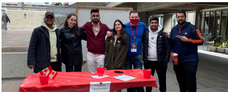
Meeting with students at Simon Fraser University.

The CESB provided income support for post-secondary students or recent graduates unable to find work due to COVID-19. This benefit ran from May to August 2020. Students were eligible for up to $1250/month ($2000 for