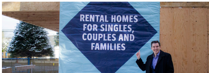
In 2022 we passed a $500 dollar support for lower-income renters to help them through the lingering effects of the pandemic.

We provided relief for small businesses experiencing financial hardship due to COVID-19. Over the course of the program, property owners reduced rent by at least 75% for April and May (retroactive) and June for their small business tenants. CECRA covered 50% of the rent, with the tenant paying up to 25% and the property owner forgiving at least 25%. Applications for CECRA closed on October 30, 2020.