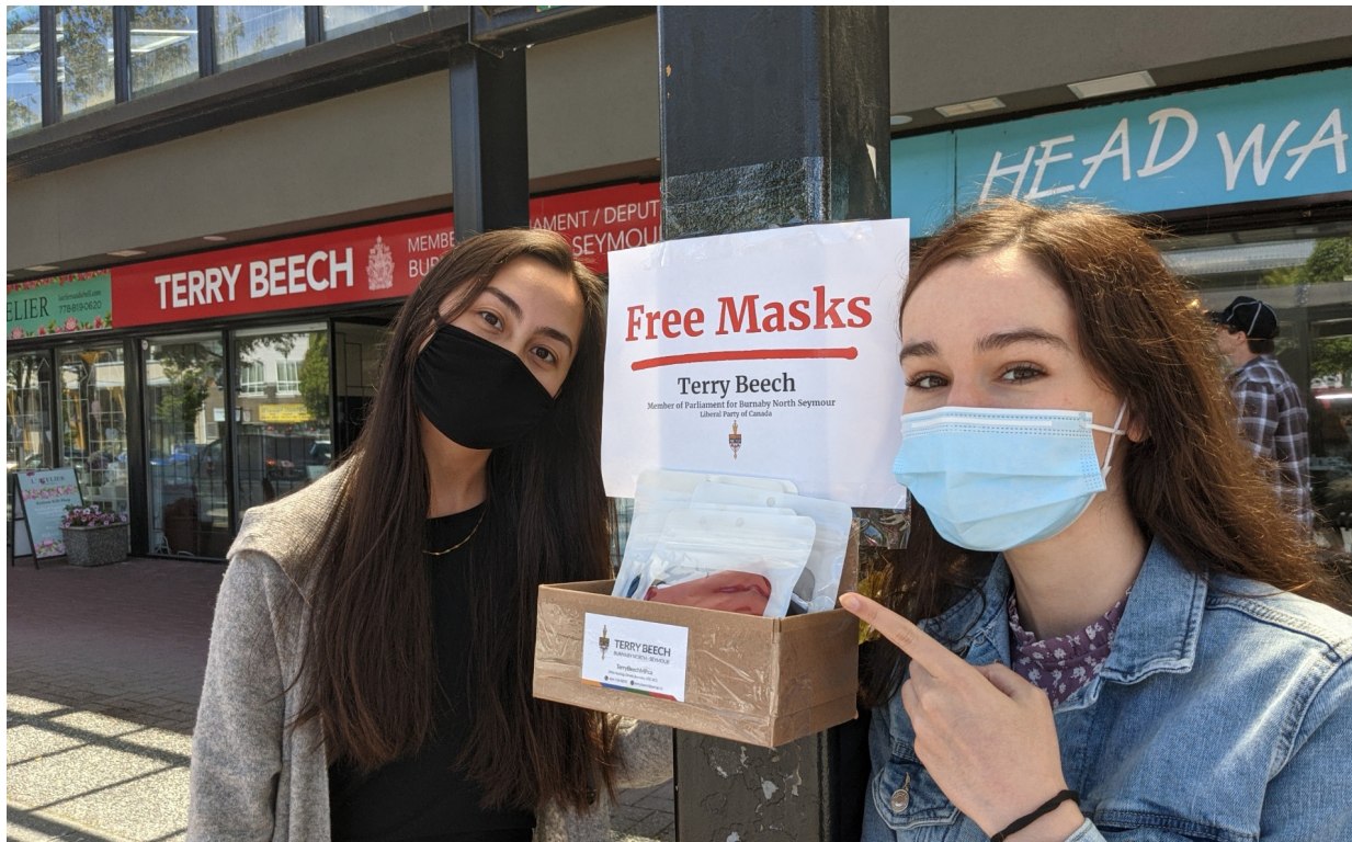
Our office provided free masks at local bus stops in our community so that everyone could be safe during their commute.

COVID-19 has upended our normal lives. We have all been affected by it in one way or another. Many have lost loved ones, their jobs, and we have all had to adapt to a new way of life. If you need any help navigating the various supports our Liberal Government has put forward, have any questions about anything contained in this report, or want to give your feedback on our Liberal Government's work, please do not hesitate to reach out to our office. Our physical office has reopened, though we continue to closely follow public health guidelines. Stay safe and stay healthy, and we will all get through this together.