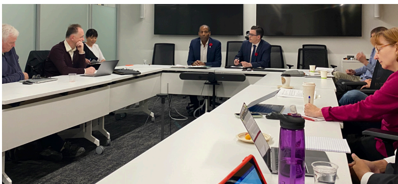
As we recover from the pandemic, we are making long-term plans to prepare Canada for the future. Greg Fergus, the Parliamentary Secretary to the Prime Minister, and I recently met with community, business, and educational leaders to learn more about what they think Canada will look like in ten years and how we can address emerging challenges.

To qualify, organizations needed to demonstrate they paid between $20,000 to $1.5 million in total payroll in 2019. Through this program, we provided 49.2 billion dollars worth of aid to help 1,470,122 businesses.