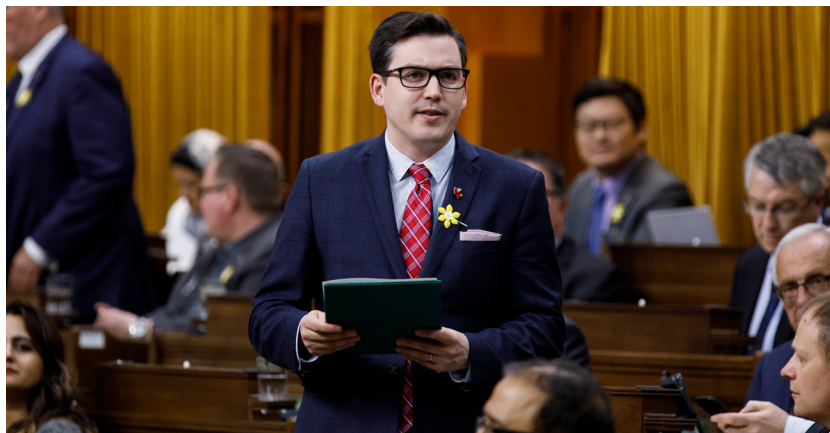
We have been working closely with our parliamentary colleagues to ensure that Canada's economic recovery continues to be the strongest in the G7.

CERB provided many Canadians with temporary income support. This included $2000/month for up to 4 months for eligible workers who have lost their income due to COVID-19, now including freelancers, seasonal workers, and the self-employed. This money was a taxable benefit, not tax-free, but our Liberal Government has created a one-time repayment plan to help those who need help with their repayment. Through CERB, we were able to support 8.16 million individual Canadians through an investment of $53.53 billion. If you or a loved one have questions about the program or other COVID-19 benefits, please visit: https://www.canada.ca/en/revenue-agency/services/benefits/apply-for-cerb-with-cra/return-payment.html .